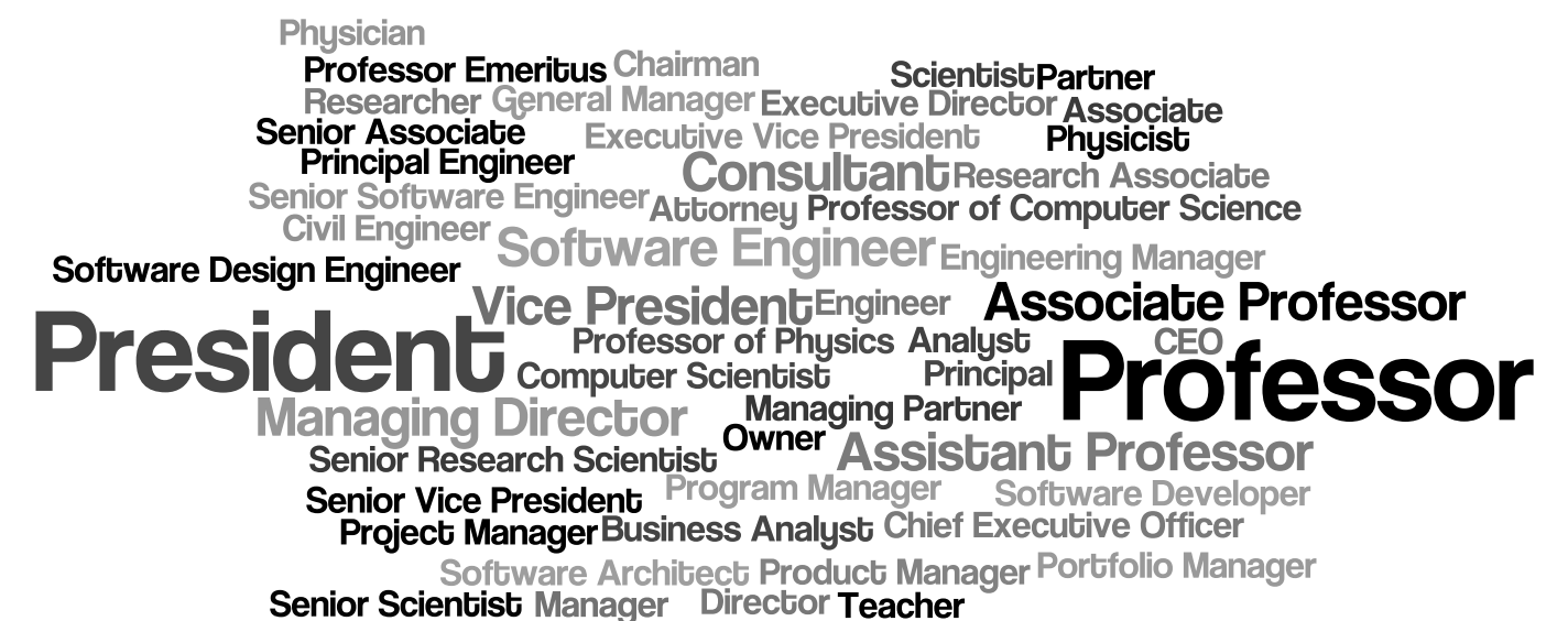
Figure 1: Titles that alumni since 1984 now hold.

Yes! CS concentrators head off in all sorts of directions after graduation. See Figure 1 for titles that alumni since 1984 now hold. See Figure 2 for fields in which alumni since 1984 can now be found.