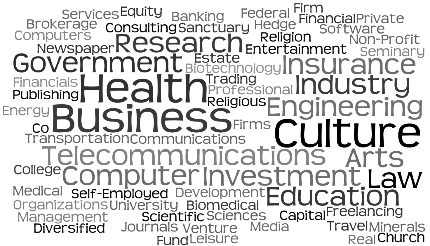
Figure 2: Fields in which alumni since 1984 can now be found.