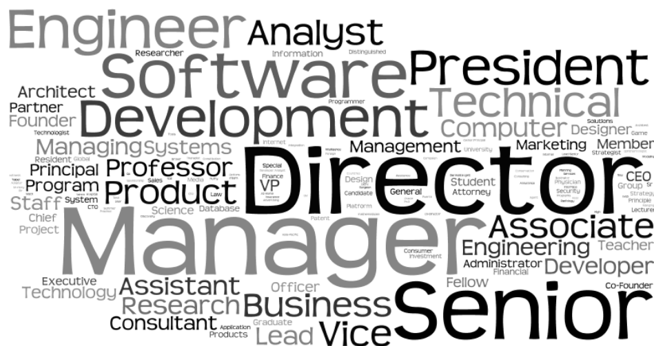
Figure 1: Titles that alumni since 1984 now hold.

If you intend to concentrate in or do a secondary in CS, you should take CS50 for a letter grade. But should you decide to concentrate in or do a secondary in CS only after taking CS50, a SAT in CS50 would count for concentration or secondary credit.