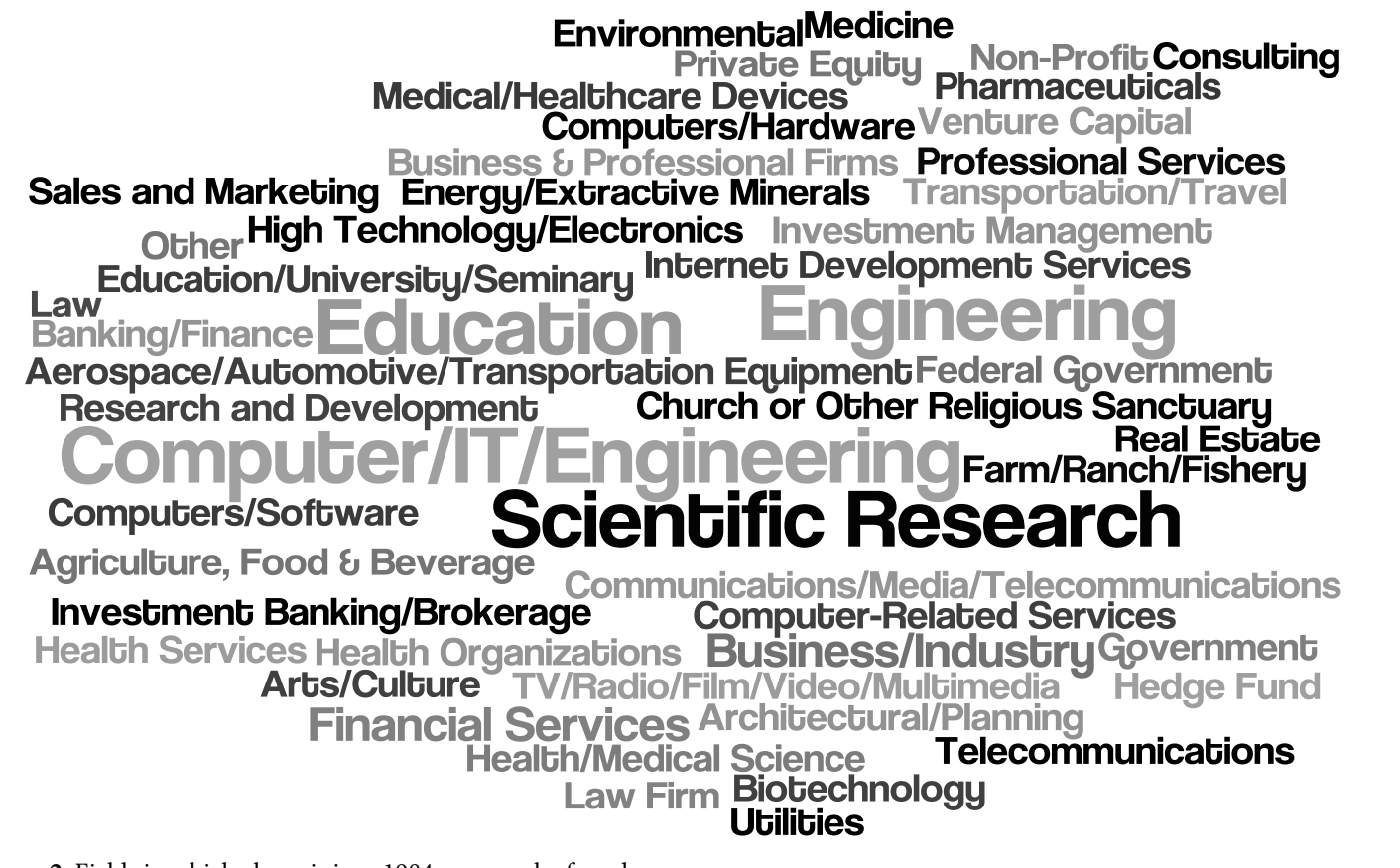
Figure 2: Fields in which alumni since 1984 can now be found.