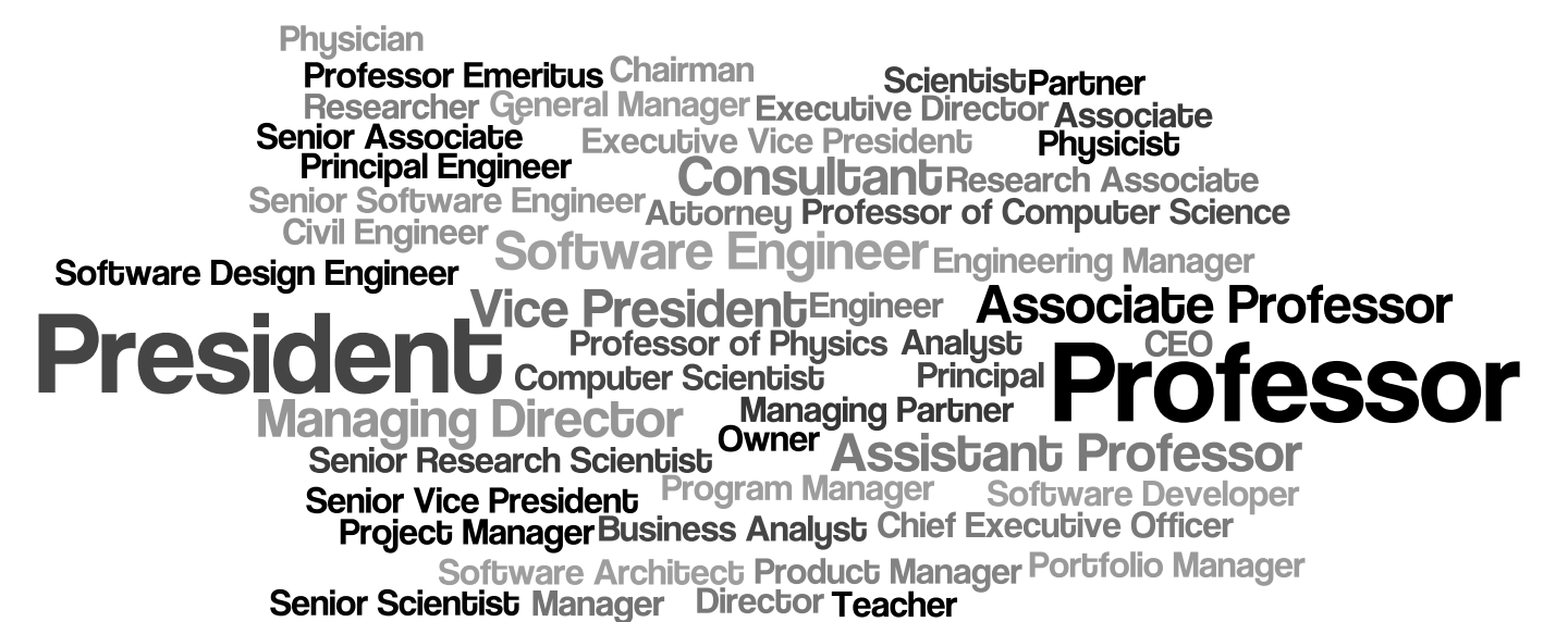
Figure 1: Titles that alumni since 1984 now hold.

Yes! CS concentrators head off in all sorts of directions after graduation. See Figure 1 for titles that alumni since 1984 now hold. See Figure 2 for fields in which alumni since 1984 can now be found.