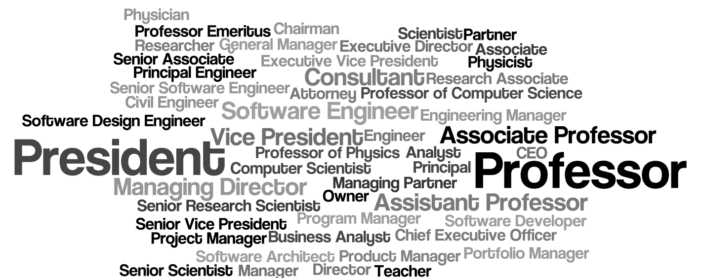
Figure 1: Titles that alumni since 1984 now hold.

Yes! CS concentrators head off in all sorts of directions after graduation. See Figure 1 for titles that alumni since 1984 now hold. See Figure 2 for fields in which alumni since 1984 can now be found.