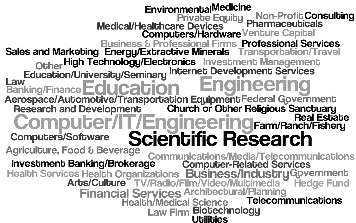
Figure 2: Fields in which alumni since 1984 can now be found.