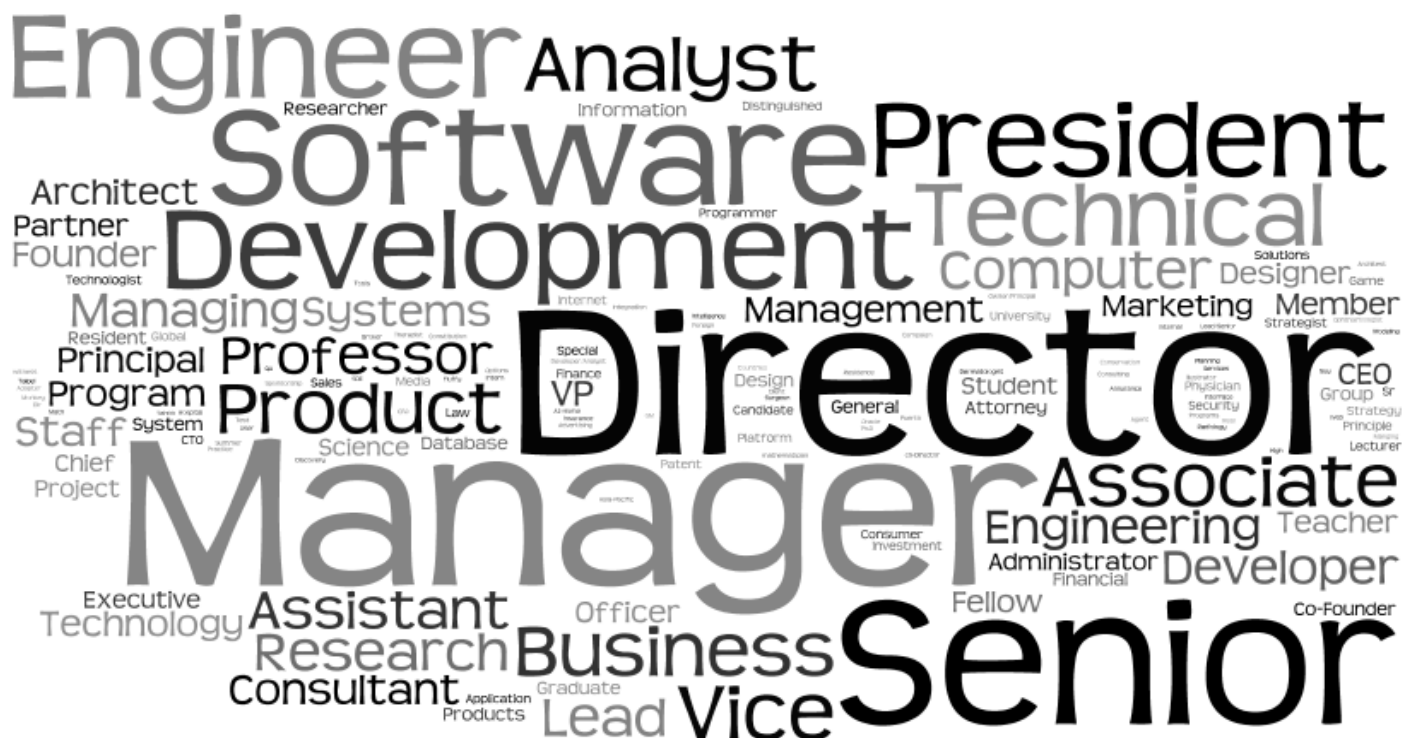
Figure 1: Titles that alumni since 1984 now hold.

Yes, but you probably shouldn’t. Joint concentrations are really for students who want to write a thesis on some research problem in the intersection of two fields. If you simply want to study both fields, it’s generally best to get a secondary or simply take courses in CS or the other field.