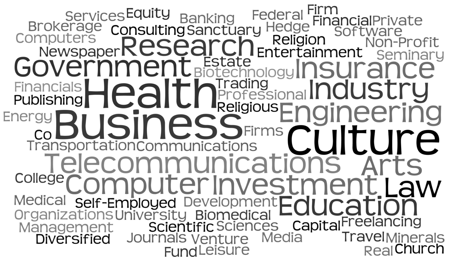
Figure 2: Fields in which alumni since 1984 can now be found.